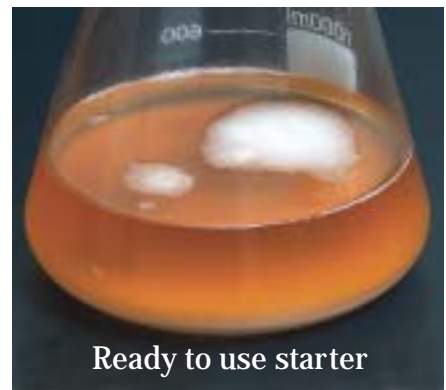
Ready to use starter

6. Now stir up the flask and add to 5 gallons of wort. Alternatively, if you cannot brew in the next day or two, the flask can be left for 3 days at room temperature. When you then use it, pour most of the liquid off first and then just add the slurry to your fermenter. Fermentation start times will be a little slower than if you had used the starter as soon as it was ready.