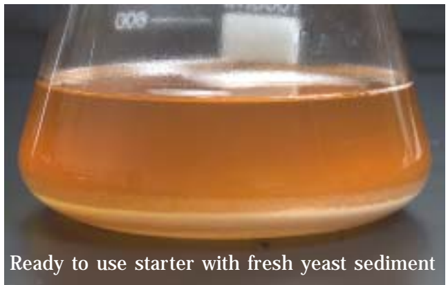
Ready to use starter with fresh yeast sediment